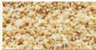
SSP2 (1.4mm - 1.7mm)