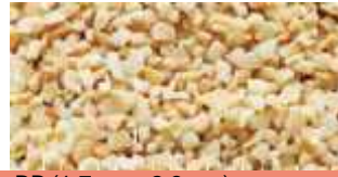
BB (1.7mm - 2.8mm)