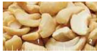
LWP (6.3mm - 8mm) 4 Pieces