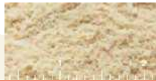
Meal (< 1.4mm)