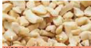
WSP(2.8mm-4.75mm) 8 pieces