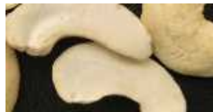
FS (Splits)- 2 Pieces